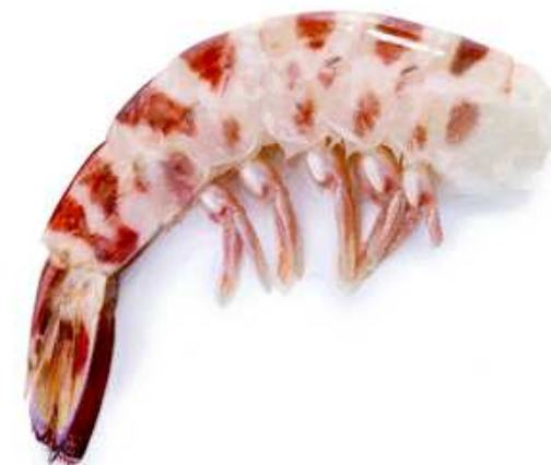
Ref.2294 Cola Langostino Tunez 17.50€/kg