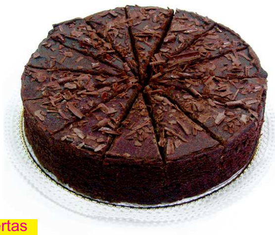
Ref.106503 Tarta Continental Chocolate 1550g 15.00€/ud