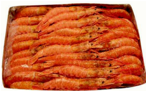
Ref.2032 Gambon nº2 20/30 2kg 8.25€/kg