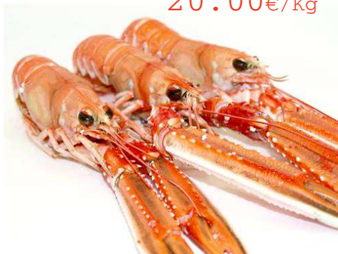
Ref.1485 Cigala nº0 Escocia 1.5kg 20.00€/kg