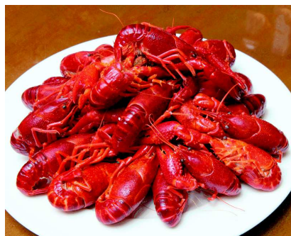
Ref.6656 Cangrejo de rio cocido 2.90€/kg