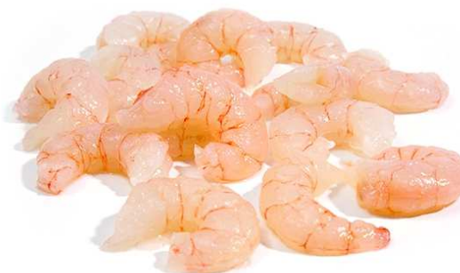
Ref.1526 Gamba Pelada 50/70 Fishen 4.90€/kg